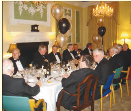
Annual Members' Dinner Gentlemen of The Lodge enjoying the benefit of their very own 'PDR' at the Club Annual Dinner.

In recent months, there have been a large number of highly successful events held at the Club.