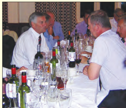
Annual Golf Day Gentlemen golfers enjoying a glass or three at the post-match dinner.