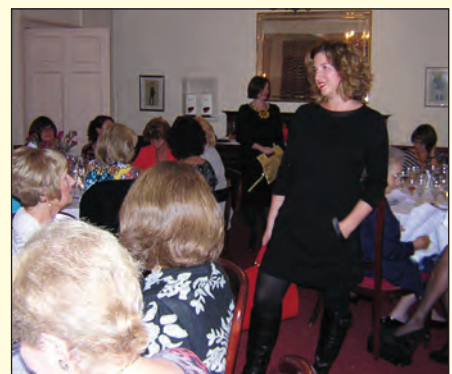
Ladies' Charity Fashion Show Lady members and their guests raised over £550 for the Saint Elizabeth Hospice charity.