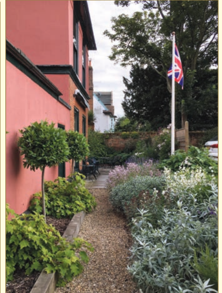
Ideal spring and summer weather conditions this year have made the Club garden blooming marvellous!