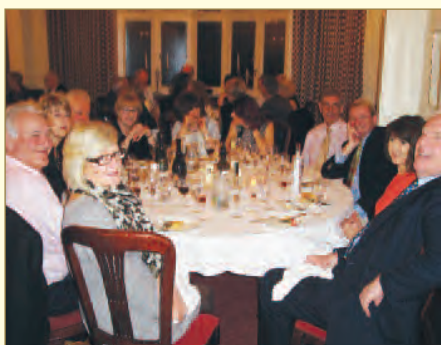
Call My Bluff Wine Tasting

In recent months, there have been a large number of highly successful events held at the Club.