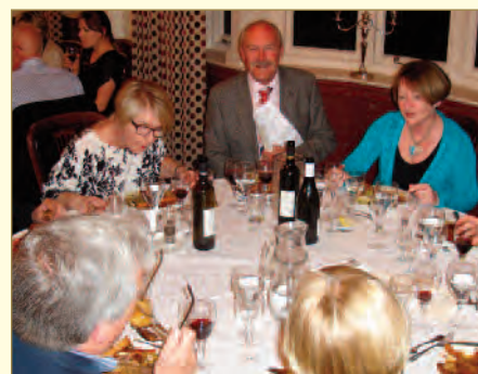
Turkish Wine Tasting