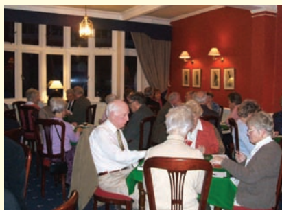
The popular Bridge drive April 2008

I think that I must have bored most of the members then, for the time was spent mostly on chalk and talk, or should I say flip chart and marker