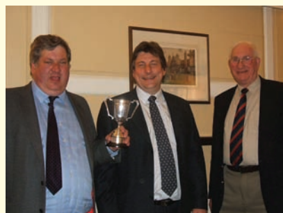
Bury Farmers had a perfect evening with us.